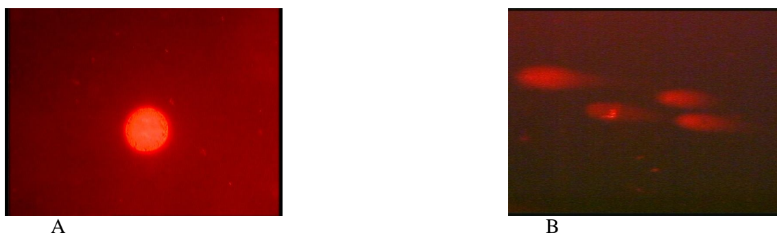
Figure 1. Image from comet assay on kidney cells: (a) A normal kidney cell: no DNA breakage and movement and (b) kidney cells exposed to Cd: significant breakage and movement of DNA following the comet assay