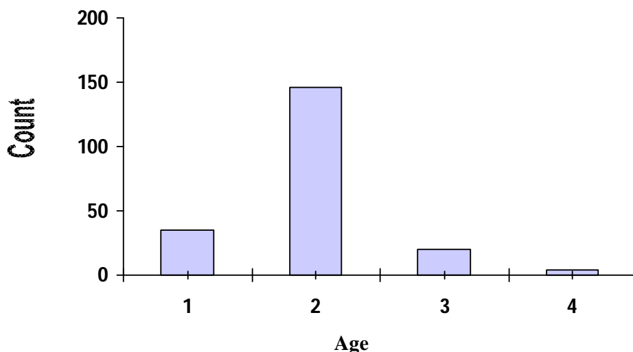
Figure1: Age of studied cases

Regarding the place of residence, 95.5% of the cases lived in large cities which indicates the greater availability of substances, more stress, and psychological problems in cities that affect the rate of poisoning.